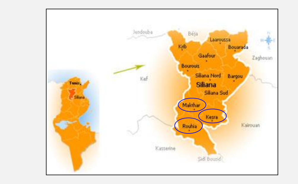
Figure 1. Map of Siliana, showing the area where the studied olive varieties widespread

The cultivated olive stands were distributed throughout these regions at altitude ranging from 1000 m (Makthar stand) to 500 m (Rouhia stand), with latitudes ranging from 35^{\circ} 86' 67" N to 35^{\circ} 33' 38" N and longitudes from 9^{\circ} 15 00" E to 9^{\circ} 18 73" E. The minimal winter temperature ranged from 1.8 \,^{\circ} C in the regions of Makthar and Kesra to 6^{\circ} C in the region of Rouhia and the annual rainfall from 500 mm to 200 mm. Therefore, the three areas display very contrasting ecological conditions.