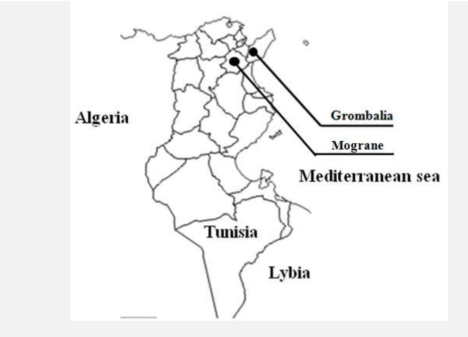
Figure 1. Geographical location of the experimental fields.