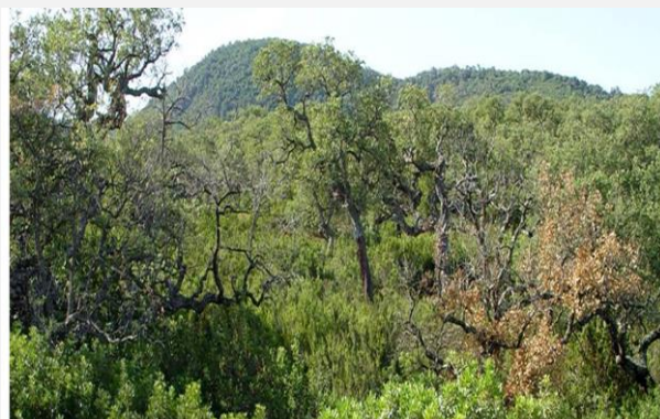
Figure 1. Declining cork oak in Tabarka.

Data of stem lesion lengths (only one independent variable) were analysed by one-way ANOVA, and mean values were compared by LSD test using Statgraphics Plus software test at p = 0.05 . This analysis for each parameter was performed to evaluate the fungi effects on plant health.