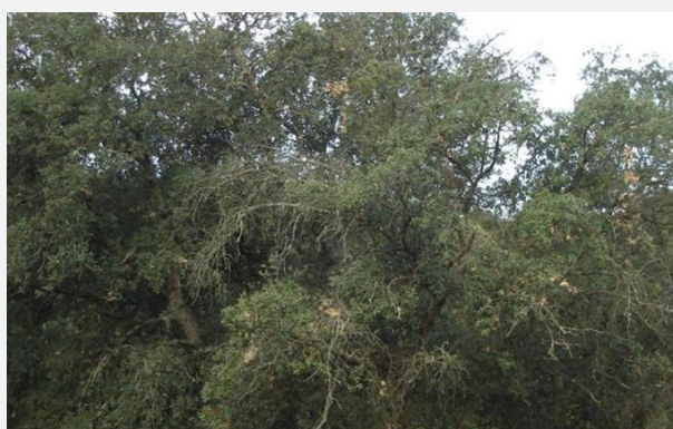
Figure 2. Cork oak trees with symptoms of branch dieback.