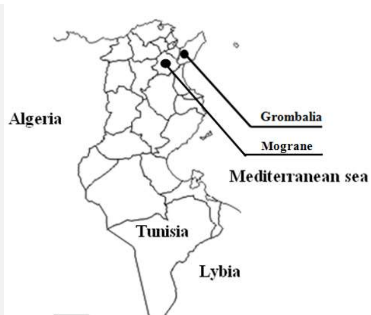
Figure 1. Geographical location of the experimental fields.